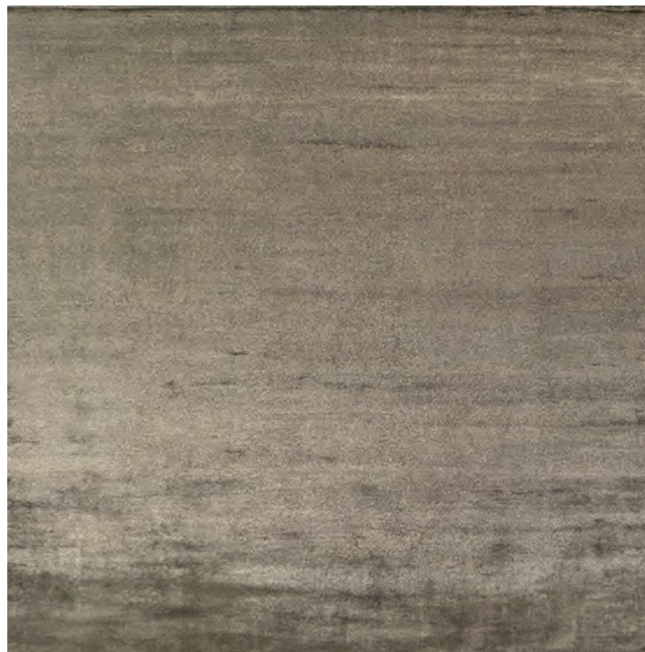
GREY / ANTHRACITE